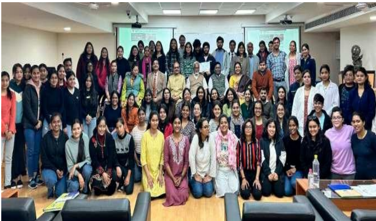
Group photo of Participants of Gestalt Psychotherapy Workshop

Outcome of the activity: The event focused on making people think about one's mental health oneself and good practices of giving up worries and preoccupations. This would further help the students to take care of one's mental health. The Gestalt workshop organized by Amity Institute of Behavioural and Allied Sciences provided participants with a rich learning experience, combining theoretical knowledge with practical application. By integrating Indian Gestalt concepts into the curriculum, the workshop contributed to a deeper understanding of how Gestalt Therapy can be adapted to diverse cultural contexts. Participants left with enhanced skills and a renewed enthusiasm for applying Gestalt principles in their therapeutic practice and personal growth journeys.