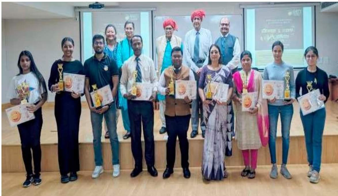
Nine winners of Manoulas Ke Navrattan

The aim of this competition was to identify nine exceptional people who are a symbol of spreading happiness through their creative art and sense of joy. Manoulas ke Navrattan represents a group of nine extraordinary people who spread happiness and joy. There are nine winners (3X3X3) in each category (1st, 2nd & 3rd)