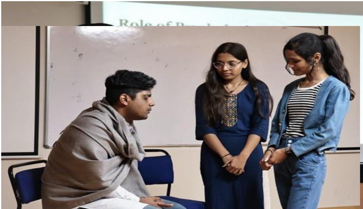
Students of MPhil Clinical Psychology