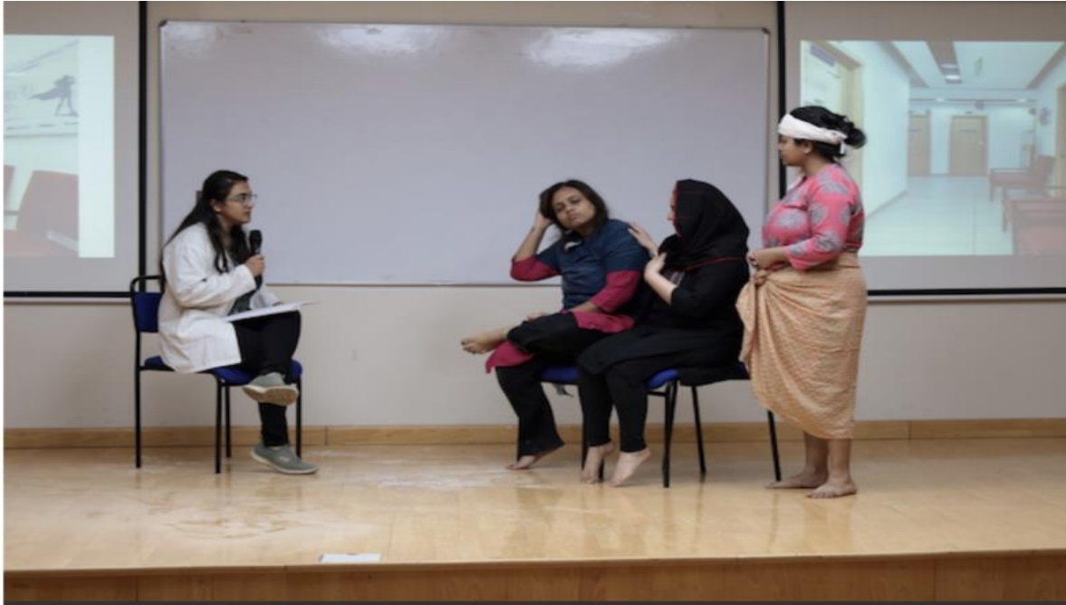
Discussions about schizophrenia in a performance

empowering individuals with knowledge and promoting a more inclusive approach towards mental health care.